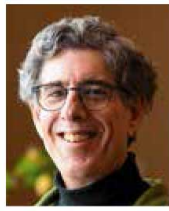
Prof Richard Davidson Prof of Psychology and Psychiatry, Founder & Director The Center for Healthy Minds University of Wisconsin-Madison