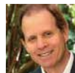
Dr Dan Siegel 丹·西格尔医生, Psychiatrist & Neuroscientist 心理医生与神经学家, UCLA and Mindsight Institute

正念不适用于治疗所有的疾病，它是一种互补药物治疗的疗愈方法。正念真的有用吗？丹·西格尔医生分享：“我亲自见证患有慢性背痛的患者在配合正念的练习中，完全恢复日常的体能活动。正念练习也常运用于支气管炎的患者，帮助他们纾解咳嗽、头痛、消化不良和睡眠困扰所带来的不适。”