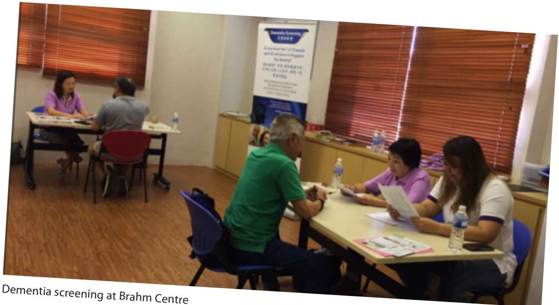
Dementia screening at Brahm Centre